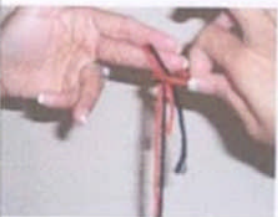
Figure 4: Close your two fingers together once you have both the Shimmer and the hair tightly clamped and pull them both through the loop as illustrated in the picture.