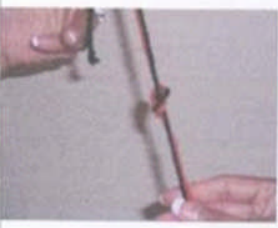
Figure 5: To make a knot as close to the root of the hair, pull the hair first and then slide the Shimmer down toward the root and slowly tighten the knot. Gently pull the other end of the Shimmer for a final tightening.

Note: It is much easier to apply this knot to another person. The shorter hair knot can be used on long hair too and easy to complete while you look in the mirror.