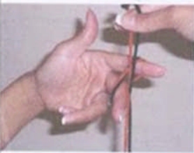
Figure 3: Take the hair and the Shimmer that you are holding in your RIGHT hand and put them both between the two fingers of your LEFT hand as illustrated in the picture.